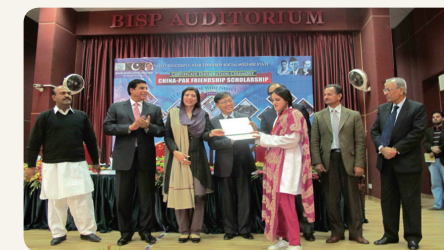
中巴友好奖学金 China-Pakistan Friendship Scholarship

CFPD has cooperated with NGOs in Mongolia, Pakistan and Zambia to provide vocational training in construction, computer and raw materials processing, etc., providing nearly 1500 training opportunities. Meanwhile, CFPD also funded vocational training centers and donated vocational training materials to those countries.