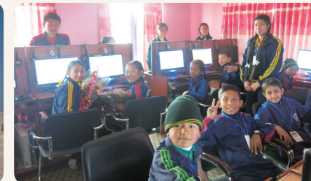
尼泊尔电子阅览室 "Friends on the Silk Road" Electronic Reading Room in Nepal