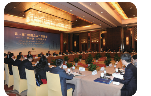
“丝路之友”对话会 "Friends on the Silk Road" Dialogue