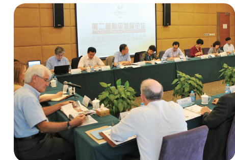
和平发展论坛 Peace and Development Forum