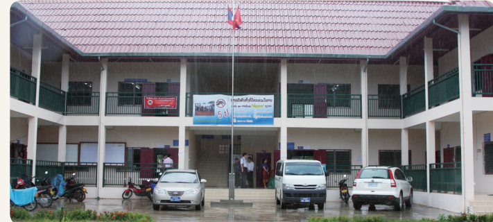
中老农冰村小学 China-Laos Nong Ping Primary School

基金会在柬埔寨、老挝、缅甸、蒙古、巴基斯坦、菲律宾、苏丹等国援建 25 所学校及幼儿园，在土耳其、塔吉克斯坦、尼泊尔等国实施 4 个电子信息教育项目，共有 10 个国家 30000 多名学生从中受益。