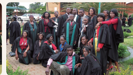
中赞友好职业技能培训 China-Zambia Friendship Vocational Training Program