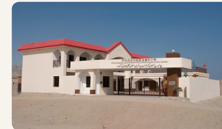
中巴瓜达尔地区法曲尔公立小学 China-Pakistan Government Primary School Faqeer Colony, Gwadar