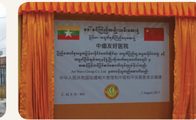
中缅友好杜庆芝医院 China-Myanmar Friendship Daw Khin Kyi Hospital