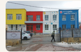
中蒙青格尔泰区儿童诊所 China-Mongolia Chingeltei Pediatric Clinic