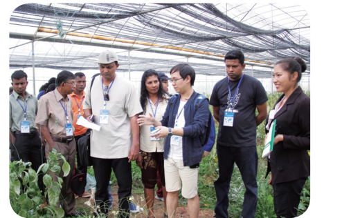
斯里兰卡现代农业发展高级研修团 Sri Lanka Modern Agriculture Senior Workshop