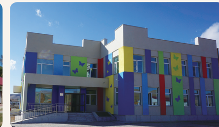
中蒙库盟幼儿园 China-Mongolia Khuumun Kindergarten