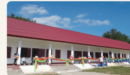
“丝路之友”小学 "Friends on the Silk Road" Primary School