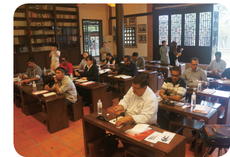
马来西亚新媒体发展研修团 Malaysia New Media Development Workshop